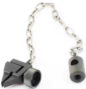
G341 with M8 coupling