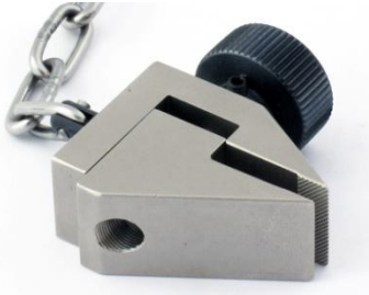
G341-15 special design clamping surface 15mm wide