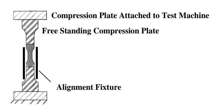
Grips per ASTM

ASTM specifies that the test fixture have two compression plates. One attached rigidly to the test machine, and the other not rigidly attached to the test machine to act as an interface between the machine and the test specimen. Both compression plates are to be made of hardened steel with hardness greater than 48 HRc. V-blocks are needed to align the test specimen and free standing compression plates. TestResources offers G838-C1424 as a fixture to align the test specimen and compression plates.